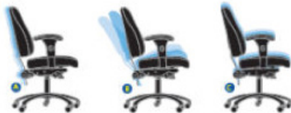
Seat & Back Tilt