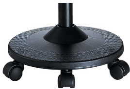
16" Diameter Solid Base