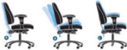
Seat & Back Tilt