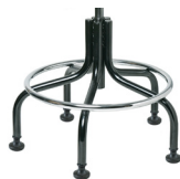
16 Gauge Tubular Steel

PAC Midwest Minneapolis, MN (888) 903-0333