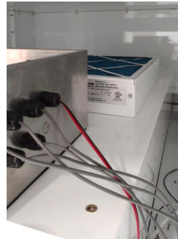
Figure 7. The blue MERV 7 pre-filter can be lifted out and replaced with a new one