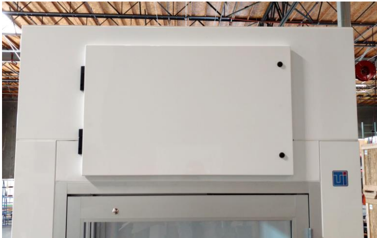
Figure 6. Open the front access door of the upper housing by quarter-turning the cam latches with a flat screwdriver