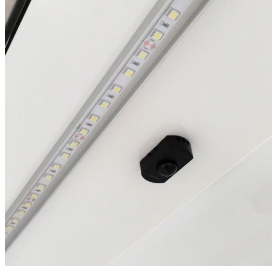
Figure 3. Motion sensor next to the LED light strip

The external air fitting (shown in Figure 4 ) is a reference point and should not be obstructed or used for any other purpose.