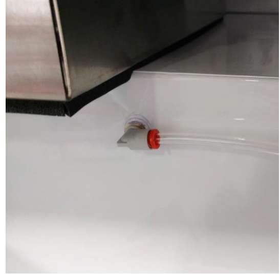
Figure 5. FFU push-to-connect fitting for pressure gauge

Users will have to manually reassess HEPA filter saturation periodically or determine an appropriate filter replacement timeline.