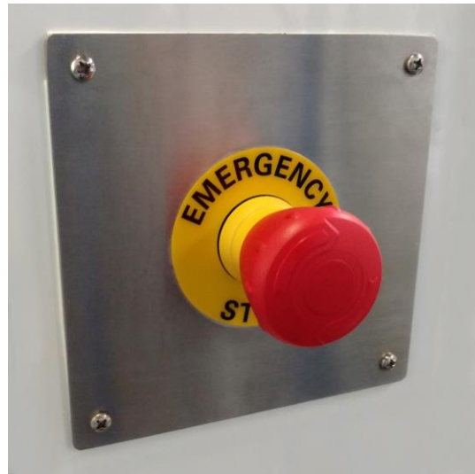
Figure 2. Emergency Stop Button (twist to reset)