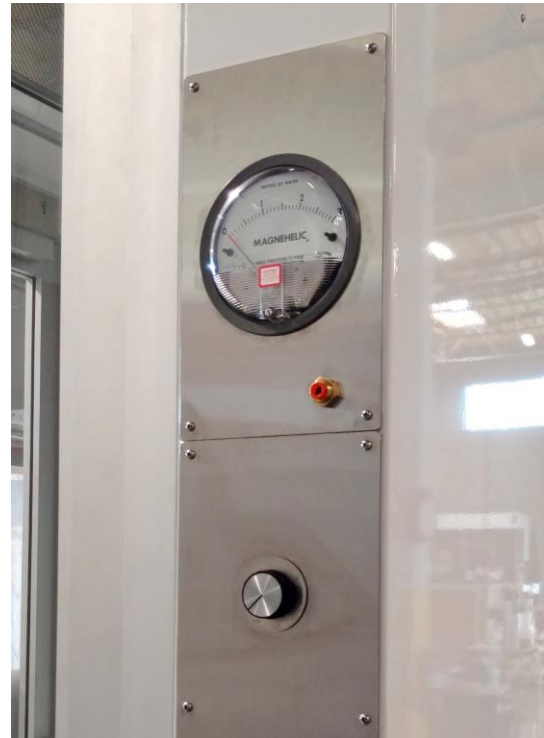
Figure 4. Magnehelic pressure gauge (with reference fitting) and speed dial as seen on a Pressurized Cleanroom Airlock