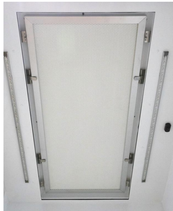
Figure 8. HEPA filter visible after removing stainless steel screen

See Section 6.0 for replacement filter part number.