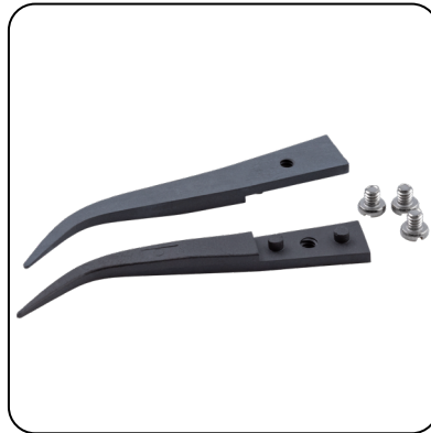
Replacement Tips Only: 7-ZJK-RT Kit of 2 Ceramic Tips and 3 screws

Unless otherwise noted, tolerance is \pm 10\% .