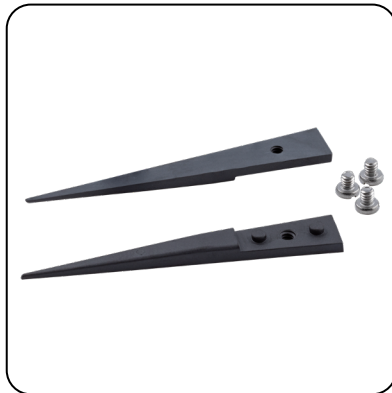
Replacement Tips Only: 71-ZJK-RT Kit of 2 Ceramic Tips and 3 screws

Unless otherwise noted, tolerance is ±10%.