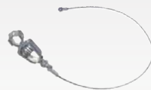
ESD-DC Drag Chain

CONVERT STANDARD WIRE SHELVING INTO CONDUCTIVE SHELVING WITH THESE ACCESSORIES THAT ARE INCLUDED WITH THESE PACKAGES