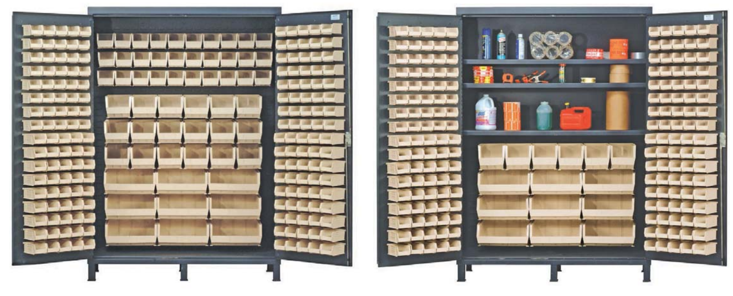
QSC-60 60"W x 24"D x 84"H. Flush Door model. Ship wt. 860 lbs. Total of 227 bins. 80 QUS210, 90 QUS220, 30 QUS230, 18 QUS240 and 9 QUS250.

Super-Wide Colossal Cabinets offer 60" or 72" widths and 84" heights allowing for maximum and efficient storage while providing superior strength and security. Standard performance features: ships completely assembled, ready to use, 14 gauge all-welded construction, gray or beige powder-coated finish which ensures years of heavy-duty service, 3 point locking handle with provision for a padlock (not included) and 6" high legs make cabinets fork truck liftable. To order a Beige cabinet, add BG right after cabinet prefix (i.e. QSC-BG-60 or MESH-BG-240 or QPR-BG-101 ). See pg. 5 for bin dimensions.