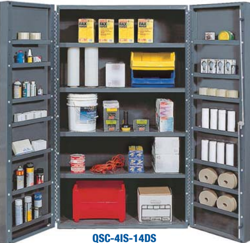
48"W x 24"D x 84"H. Deep Door Model. Ship wt. 572 lbs. 4 adjustable interior shelves and 14 adjustable door shelves. 400 lb. capacity per interior shelf. 60 lb. capacity per door shelf.

48"W x 24"D x 78"H. Flush Door Model. Ship wt. 515 lbs. Total of 84 bins. 20 QUS240, 64 QUS220, 2 adjustable interior shelves and 6 door shelves. 400 lb. capacity per interior shelf. 60 lb. capacity per door shelf.