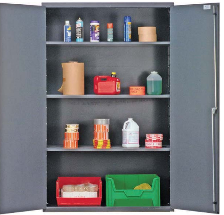
QSC-3IS 48"W x 24"D x 78"H. Flush Door model. Ship wt. 323 lbs. 3 adjustable shelves. 400 lb. capacity per shelf.

CABINET ARRIVES FULLY ASSEMBLED READY TO USE