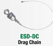
ESD-DC Drag Chain

CONVERT STANDARD WIRE SHELVING INTO CONDUCTIVE SHELVING WITH THESE ACCESSORIES THAT ARE INCLUDED WITH THESE PACKAGES