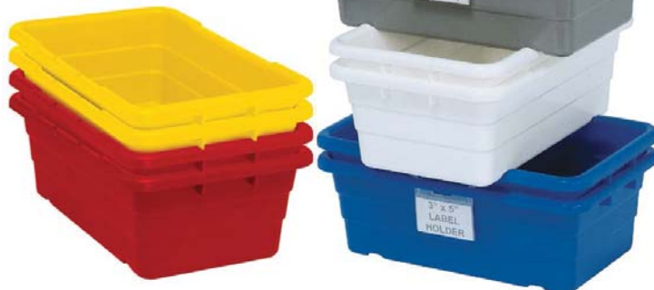
TUB2516-8 Nesting and Cross Stack