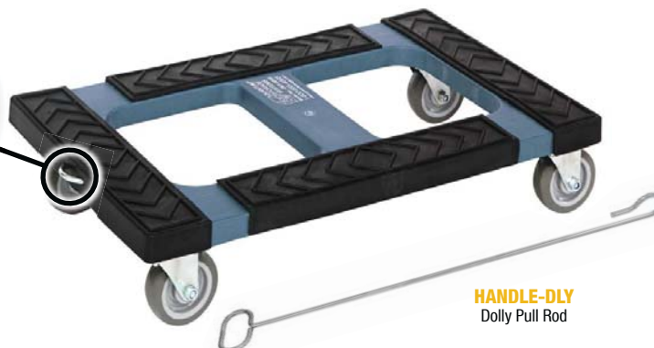
HANDLE-DLY Dolly Pull Rod