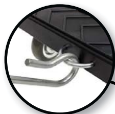
ATTACHED PULL RING allows dolly to be pulled with ease