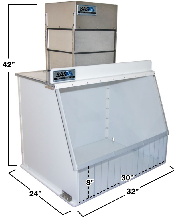
Shown with outer dimensions. Dimensions are approximate.