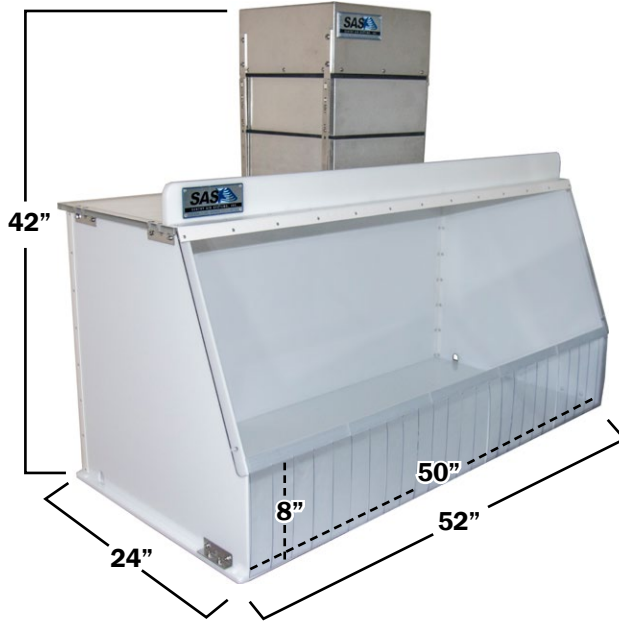
Shown with outer dimensions. Dimensions are approximate.