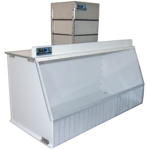
50" High Efficiency Ductless Fume Hood

Please note that the high-efficiency ductless fume hoods are compliant for nonsterile HD compounding only and not for sterile preparations.