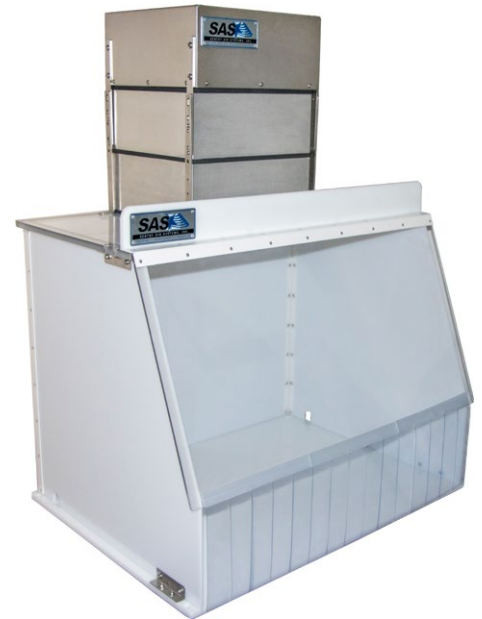
30" High Efficiency Ductless Fume Hood

Please note that the high-efficiency ductless fume hoods are compliant for nonsterile HD compounding only and not for sterile preparations.