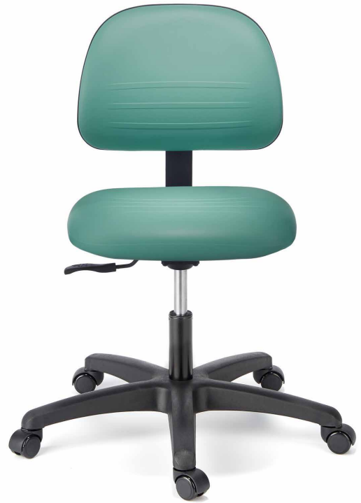
Fusion® Fit R+

The chair that sets the standard for versatility in Med-Tech environments. Shown in Graphite.