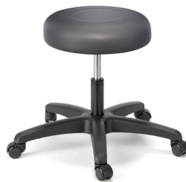
Fusion Round Stool R+