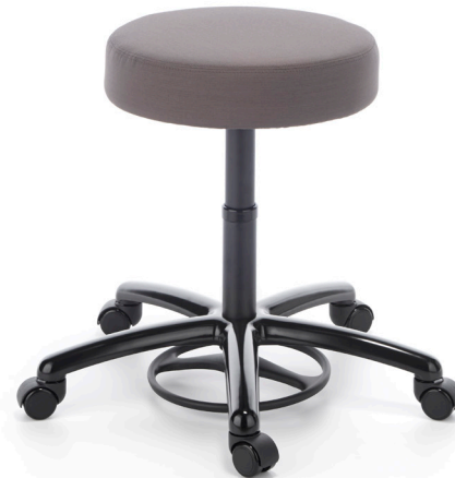
Fusion Round Stool

Slightly smaller footprint, same quality and proven performance