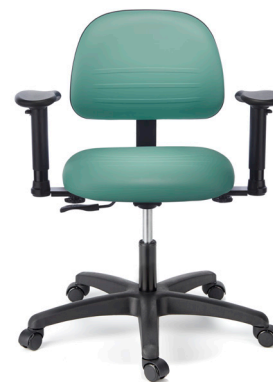
Fusion Fit R+