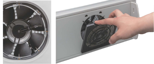
Auto-Cleaning Brush and Grille Opening