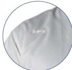
Optional Badge Holder