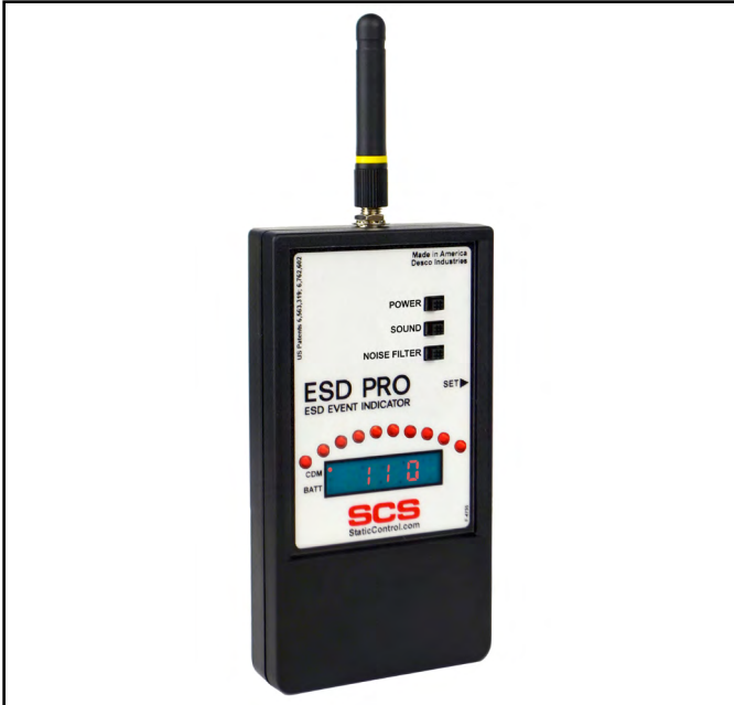
Figure 1. SCS CTM082 ESD Pro - ESD Event Indicator