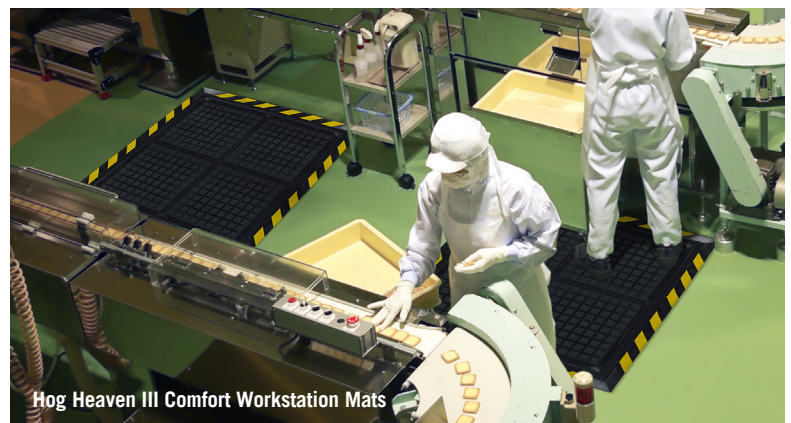
Hog Heaven III Comfort Workstation Mats