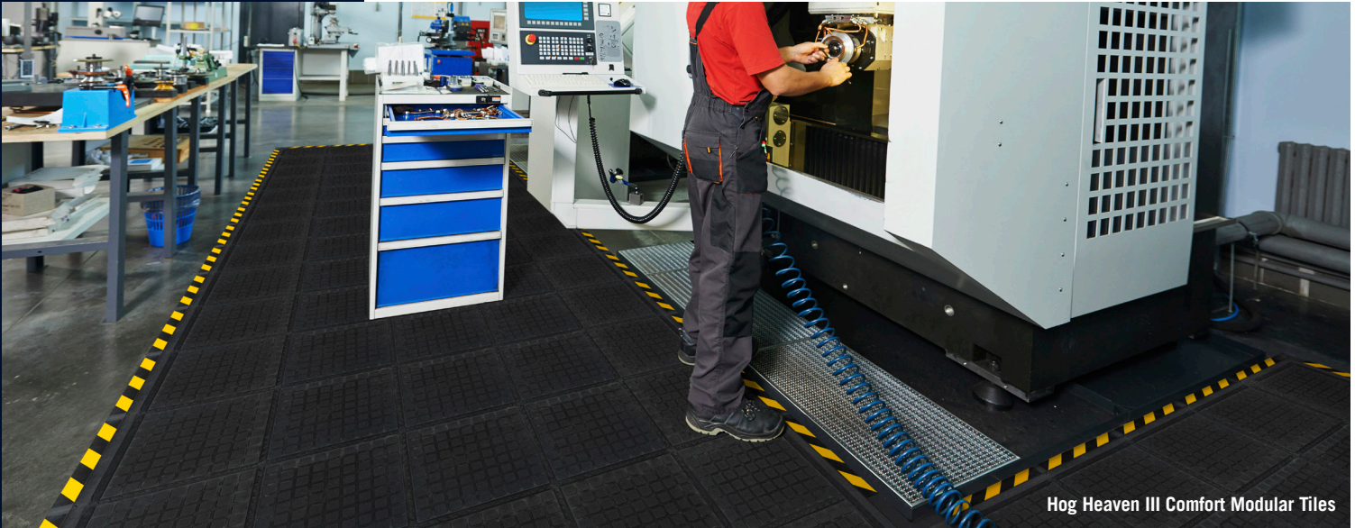
Hog Heaven III Comfort Modular Tiles