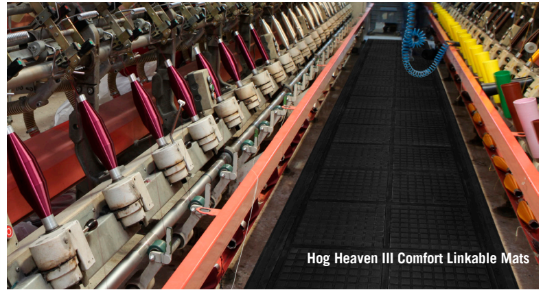
Hog Heaven III Comfort Linkable Mats

Note: Mat sizes are approximate as rubber shrinks and expands in conjunction with temperature and time. Tolerable manufacturing size variance is 3-5%.