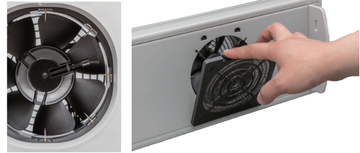
Auto-Cleaning Brush and Grille Opening