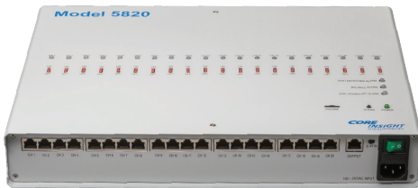
Model 5820 Ionizer Monitoring System