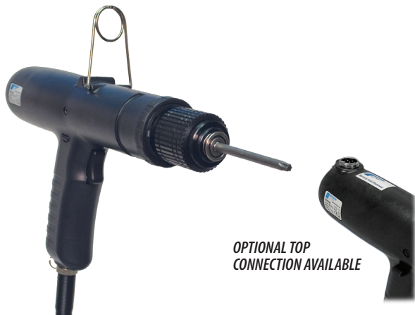
OPTIONAL TOP CONNECTION AVAILABLE

*Standard model has cable connection in bottom of handle — for top connection, add suffix 'U'. For ESD-safe housing, add suffix '-ESD'.