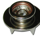
CS1010 - Female Socket