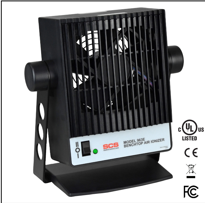
Figure 1. SCS 963E Benchtop Air Ionizer

The 963E Benchtop Air Ionizer and its accessories are available as the following item numbers: