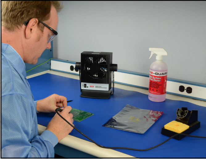
Figure 2. Using the 963E Benchtop Air Ionizer