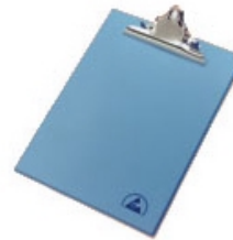
B7602 Clip board